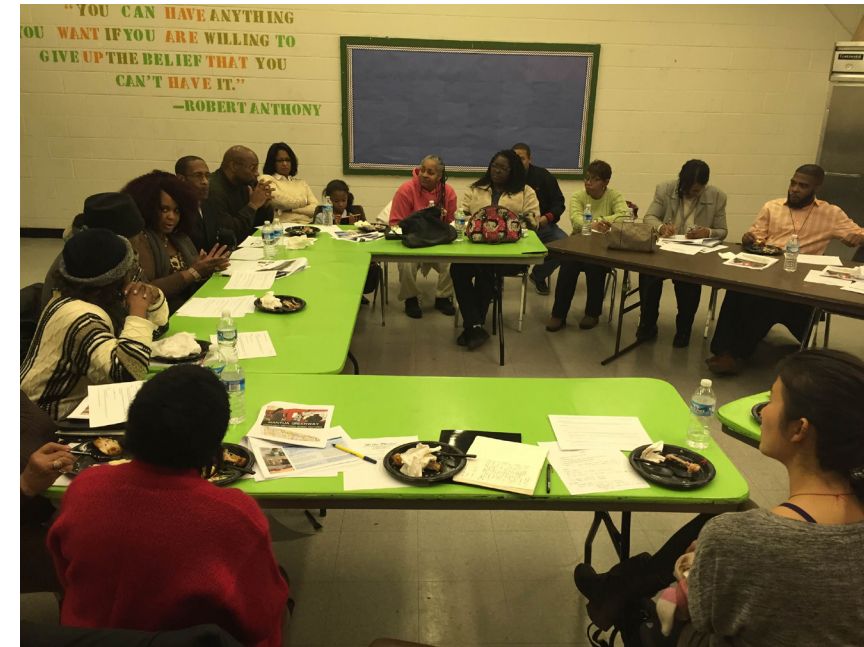
Mantua Greenway Resident Advisory Committee January 2016 Meeting

During the focus groups, community members lamented the state of Mantua Avenue as an unsafe environment characterized by abandonment and distress. Participants discussed how the walkway improvements made in the 2000s between 31st and 34th streets were an important start, but insufficient to make Mantua Avenue a desirable place to walk. Through these conversations, the Mantua Avenue Revitalization Initiative began, focusing on a comprehensive set of improvements to enhance and expand the existing greenway along Mantua Avenue through the redevelopment of vacant properties. The project aims to use public and private land for both new housing and active recreation. With these improvements, residents and project partners envision Mantua Avenue as the "neighborhood's front yard" 14 .