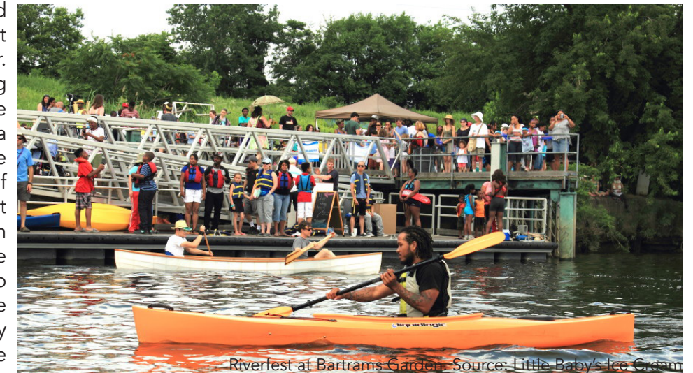
Riverfest at Bartrams Garden.

Bartram’s Garden has also expanded its programming to reconnect people to the Schuylkill River. Weekly free boating and fishing days attract local residents, and the monthly full moon paddle is also a crowd pleaser. Special events like RiverFest, an annual celebration of the river featuring a colorful boat parade and free public kayaking on the river, bring hundreds of people to the river bank. The river also serves as a classroom for people to learn about the region’s ecology and natural history. Roy sees these programs as a way to not only connect to the community, but to also return to the roots of Bartram’s Garden when John Bartram used the river as a regular resource 29 .