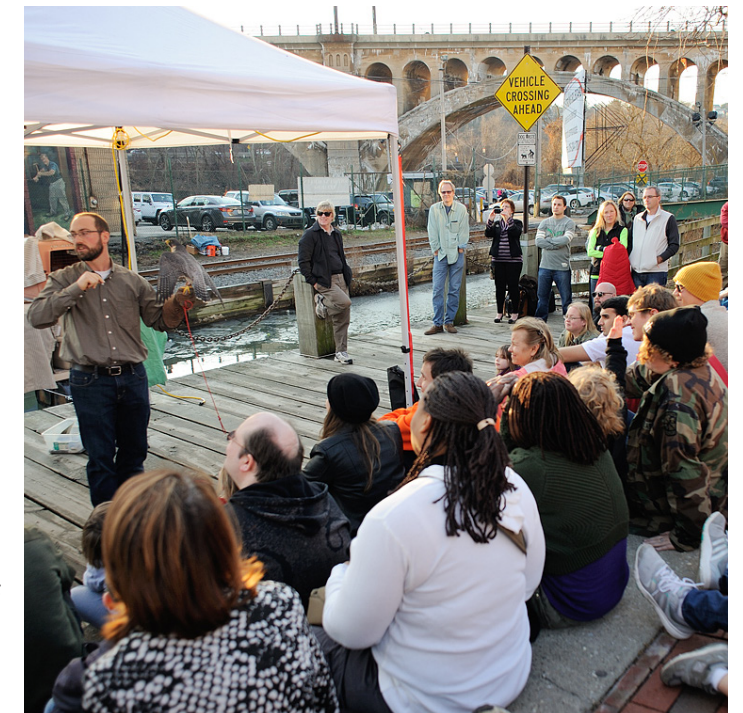
Schuylkill River Town event on the Manayunk Towpath