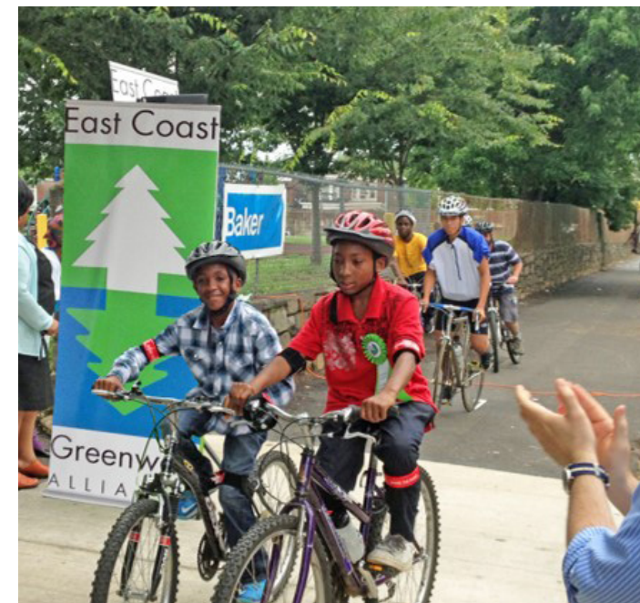
Neighborhood Bike Works participants are first to ride on the Greenway at the ribbon cutting.

In addition to incorporating feedback into the design itself, PEC also partnered with the Francis Myers Recreation Center to create the “Get Active 58th!” healthy living program aimed at making exercise on 58th Street a regular pastime. To promote a more active lifestyle the program ran every weekend over the course of two summers before the trail was constructed and included activities such as yoga, zumba dancing, runs, rides and even a 5k race. Additionally, Neighborhood Bike Works ran classes for kids to learn how to fix (and earn) bikes 23 .